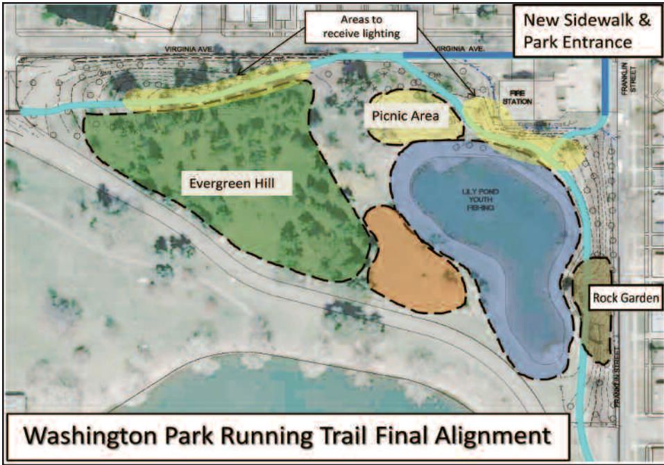
Final Plan: Approved by Denver Parks and Recreation, this map depicts what the Washington Park Running Trail will look like.