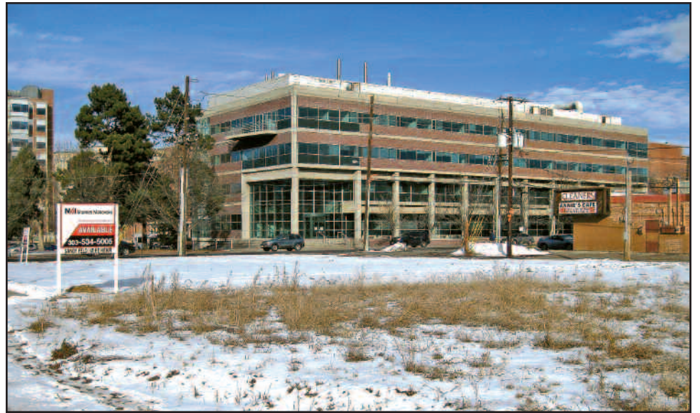
Buzz Central: The vacant lot prime for development at 8th Avenue and Colorado Boulevard is attracting an enormous amount of rumors as to what will be built there.

But the Trader Joe's corporate office denied that the company had any plans to move to 8th and Colorado. The Boulder Daily Camera then reported that it had a source who claimed that the sought after grocer was "most likely" going to open up on Boulder's Twenty Ninth Street.